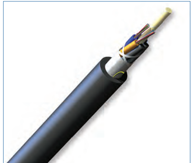
Part Number: 024EUF-T4101D20

Outdoor lashed aerial and duct; indoor vertical riser and general purpose horizontal according to National Electrical Code (NEC) Article 770