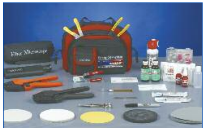
TKT-ANAEROBIC2 Installation Tool Kit | Photo LAN395